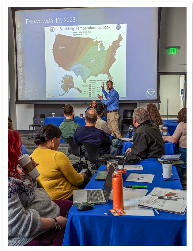
Las Vegas Tabletop Exercise in December 2022

It is possible to include virtual participants, but difficult. If virtual participation is necessary, consider assigning a digital experience lead role to somebody in the room who can make sure to speak up if virtual attendees are not able to break into the conversation. Also consider having a virtual breakout group that can have discussions with each other.