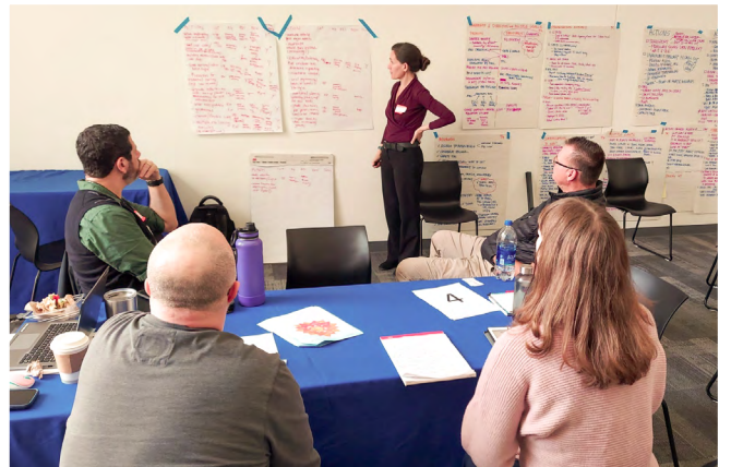
Las Vegas Tabletop Exercise in December 2022

It was often challenging to find quantitative sources of information about potential disruptions to energy, transportation, water, or other infrastructure systems. When impacts cannot be projected from models or quantitative information is not available, it is possible to extrapolate impacts from past observed events (e.g., prior heat waves in the TTX community or similar communities), and in some cases only qualitative descriptions were possible. News articles often capture narrative details of these events and are useful in TTXs.