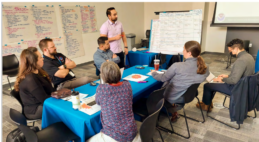
Las Vegas Tabletop Exercise in December 2022