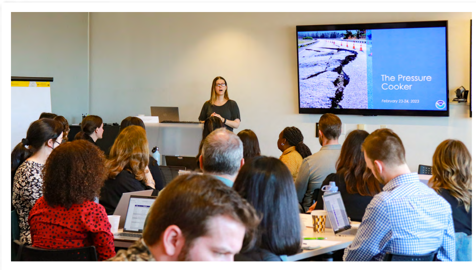
Phoenix Tabletop Exercise in February 2023