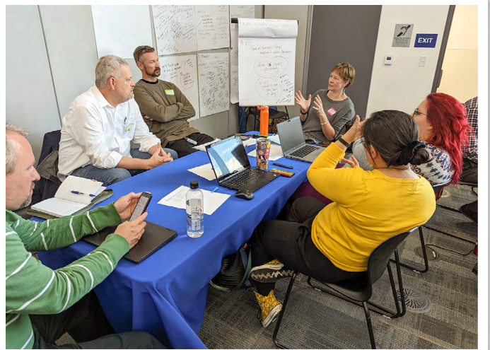
Las Vegas Tabletop Exercise in December 2022

Local practitioners, experts and organizations involved in climate resilience, emergency management, or public health can provide insights into areas that are most at risk from extreme heat events. These individuals are also key to include in the planning committee or as exercise participants. They will be the planners and actors in the tabletop exercise, setting its goals and receiving its outputs to act on. Appendix I also provides common key practitioner and expert contacts to consider involving in your TTX.